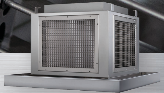
DROP BOX DIFFUSERS

KEES simplifies air distribution with drop box diffusers. Our single-point systems effectively distribute air in multiple directions without the need for ductwork. KEES offers a myriad of product options to fit virtually any building type or size, including stainless steel for harsh or humid environments. These durable, high-quality drop boxes are ideal for expansive spaces such as warehouses, food processing and manufacturing facilities, sports arenas, shopping centers and other large-scale retail spaces.