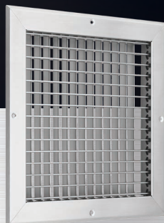
STAINLESS STEEL GRILLES

BEAUTIFUL, STAINLESS SOLUTIONS BUILT TO HANDLE THE UGLIEST SITUATIONS.