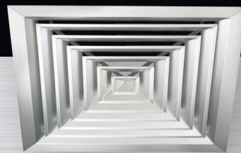
STAINLESS STEEL DIFFUSERS